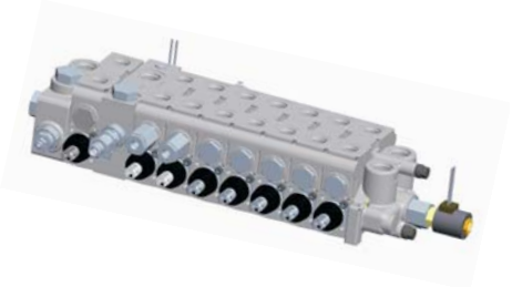
Directional control valve assembly with integrated unloading valves for lift and tele and selectable winch boost