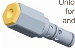
Unloading valve for work ports and two speed winch operation