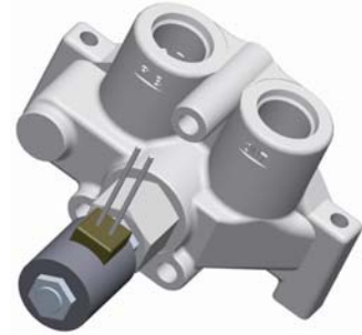
Solenoid selectable power-beyond outlet

Our long standing application knowledge of these machines has enabled Parker to develop features truly valued by the customer and the end-user.